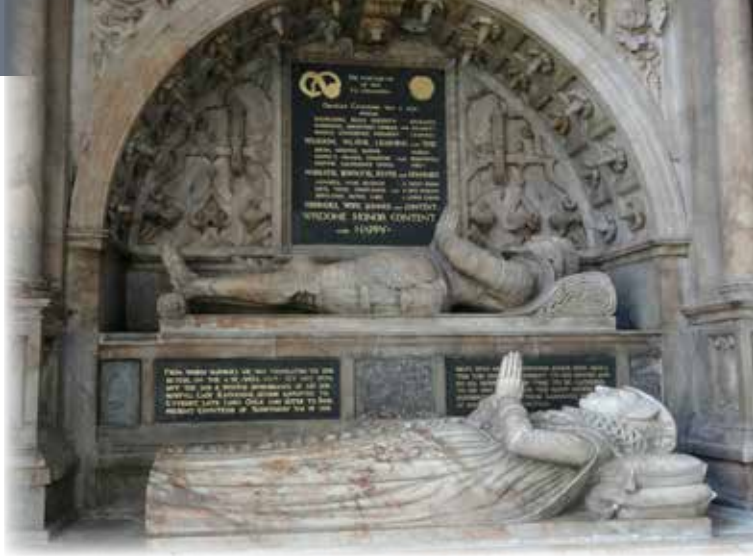
The Charles Cavendish Monument

Sir Charles Cavendish (1553-1617) Charles was the youngest son of Bess of Hardwick and William Cavendish, the second of her four husbands. Charles acquired Welbeck Abbey and the ruins of Bolsover Castle in 1608 from his stepbrother, who was also his brother-in-law, Gilbert Talbot. Gilbert was Earl of Shrewsbury and lived at Sheffield Castle. Charles' epitaph, composed by Ben Johnson, in large letters on his tomb states that he was "happy - content - wise".