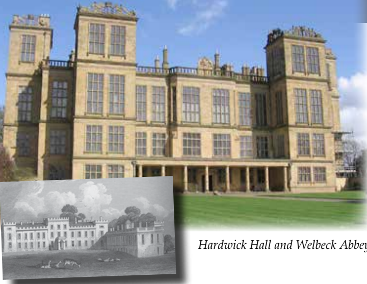
Hardwick Hall and Welbeck Abbey

Sir Charles Cavendish (1553-1617) Charles was the youngest son of Bess of Hardwick and William Cavendish, the second of her four husbands. Charles acquired Welbeck Abbey and the ruins of Bolsover Castle in 1608 from his stepbrother, who was also his brother-in-law, Gilbert Talbot. Gilbert was Earl of Shrewsbury and lived at Sheffield Castle. Charles' epitaph, composed by Ben Johnson, in large letters on his tomb states that he was "happy - content - wise".