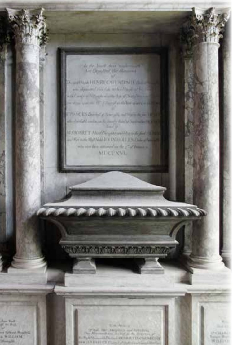
The Henry Cavendish Monument