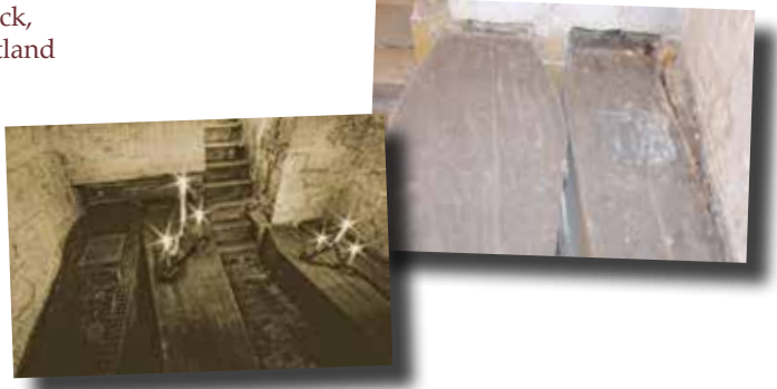
Above: Inside the crypt. Below: Bolsover Castle

Henrietta Cavendish Holles, Countess of Oxford (1694-1755) Lady Henrietta was reputed to be the wealthiest heiress in the country. She was the only child of Margaret Cavendish and John Holles, who became Duke of Newcastle when Henrietta's grandfather Henry died without a male heir. Henrietta married the 2nd Earl of Oxford and Mortimer and was mother to Margaret Bentinck, Duchess of Portland. Henrietta was said "to have [in] abundant measure the graces of amiability, considerateness and sincerity that made her generally beloved." She helped design the second monument in the Chapel.